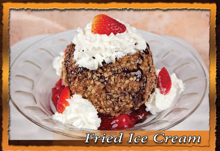
Fried Ice Cream

Pictures in this menu are for illustrative purposes only. Product may vary when served. • We are not responsible for lost or stolen items • Sorry no personal checks We reserve the right to refuse service to anyone • We reserve the right to limit alcohol consumption • If you order alcoholic beverages, be ready to show your ID We are not responsible for damaged or stolen vehicles • Prices subject to change without notice