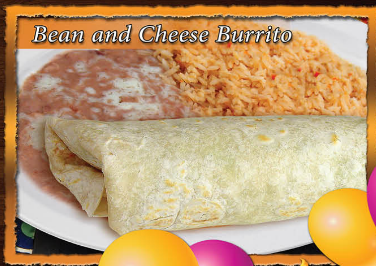
Bean and Cheese Burrito